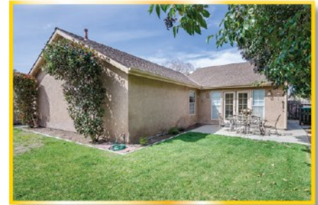
Fenced Rear Yard With Patio

INFORMATION HEREIN DEEMED RELIABLE BUT NOT GUARANTEED. VERIFY INDEPENDENTLY.