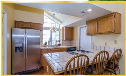
Breakfast Bar Counter

Located in the Distinguished Orcutt School District!