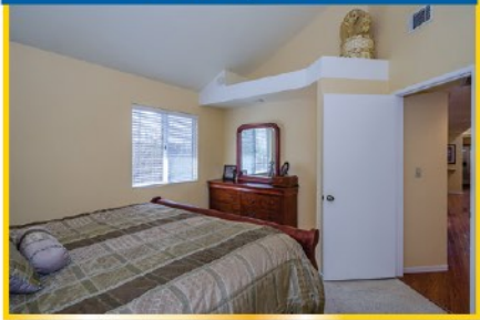
Master Bedroom Has Vaulted Ceiling